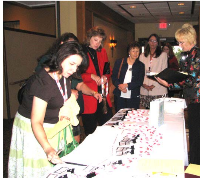
Seminar registration with bonus gifts!