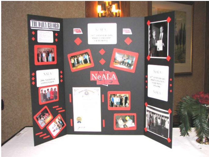
NeALA through the years