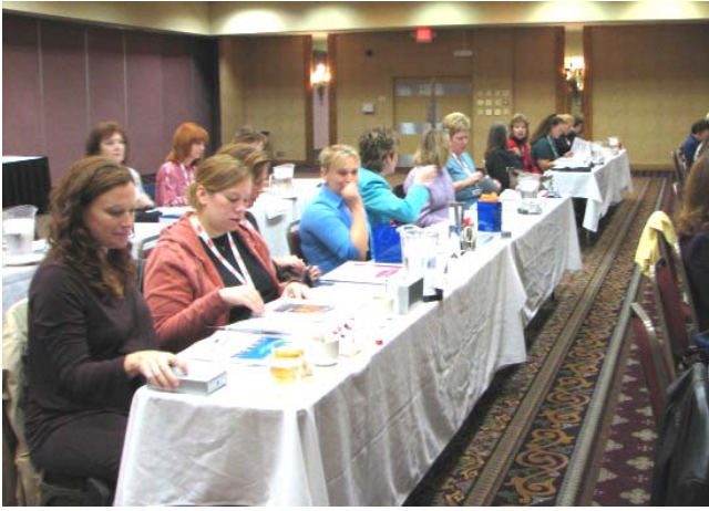
Listening intently, concentrating hard on the presentation