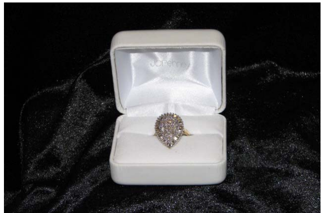
Is this what everybody came for?