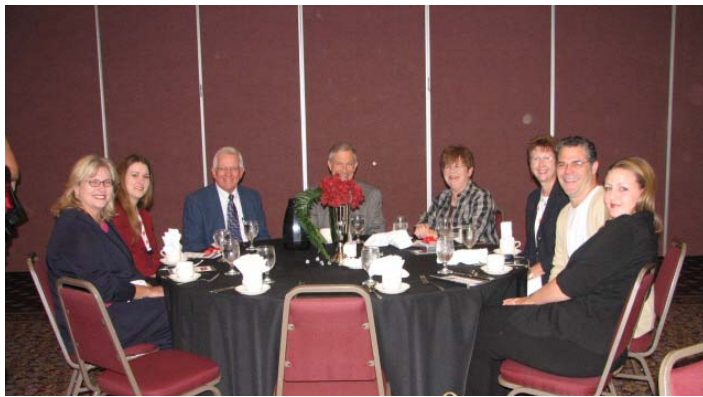
And a good time was had by all!