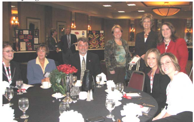
Familiar faces at the Koley Jessen table