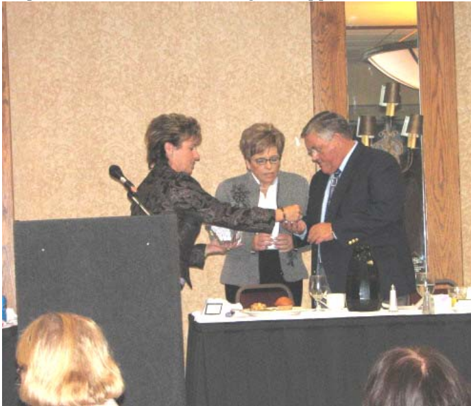
The big moment! the drawing for the ring!