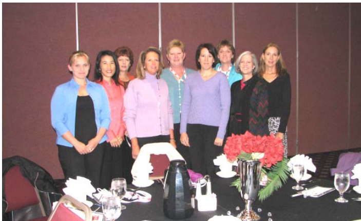
Breakfast guests from Mutual of Omaha