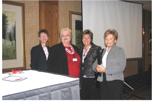
A deep breath and a smile before we start the show.